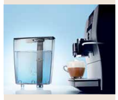
Intelligent Fresh Water System with RFT