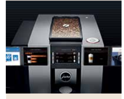
Extremely simple operation